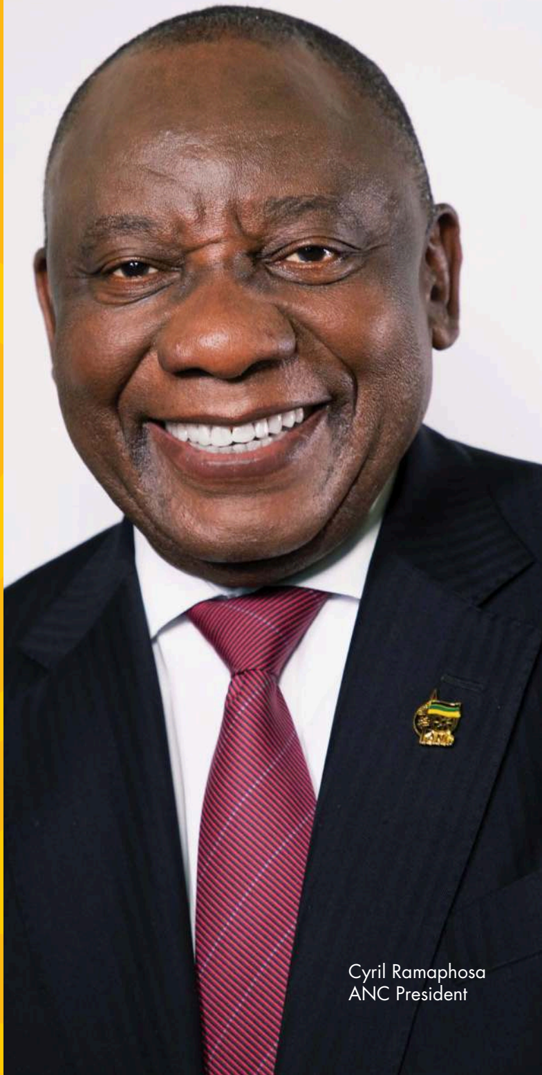
Cyril Ramaphosa ANC President